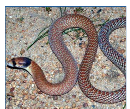
Hooded scaly-foot legless lizard.