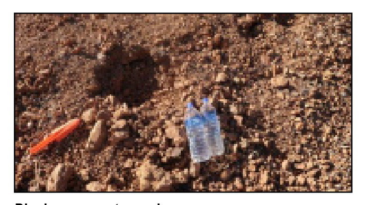
Digging up a water cache.

The track has a number of permanent waterholes at various locations but these are often used by travellers who wash or bathe in the water.