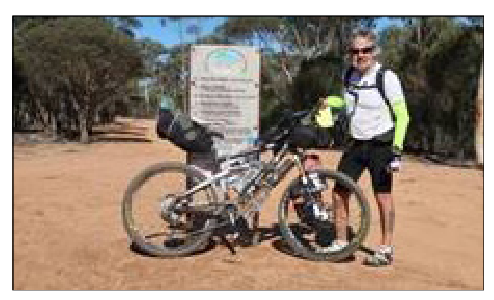
Start location of the Holland Track.

Water: The availability of water is dependent on the time of year you are riding. I carried eight litres which didn't last for two days in the peak summer heat (higher than 38 degrees Celsius). When this ride was done rock pool water was found, filtered and used – gladly! But be sure you know what you are doing to ensure that the water is clean and free from parasites.