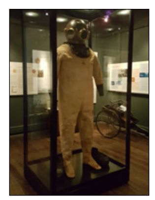
The Coolgardie Visitors Centre has an extensive display telling the story of the Varischetti rescue.