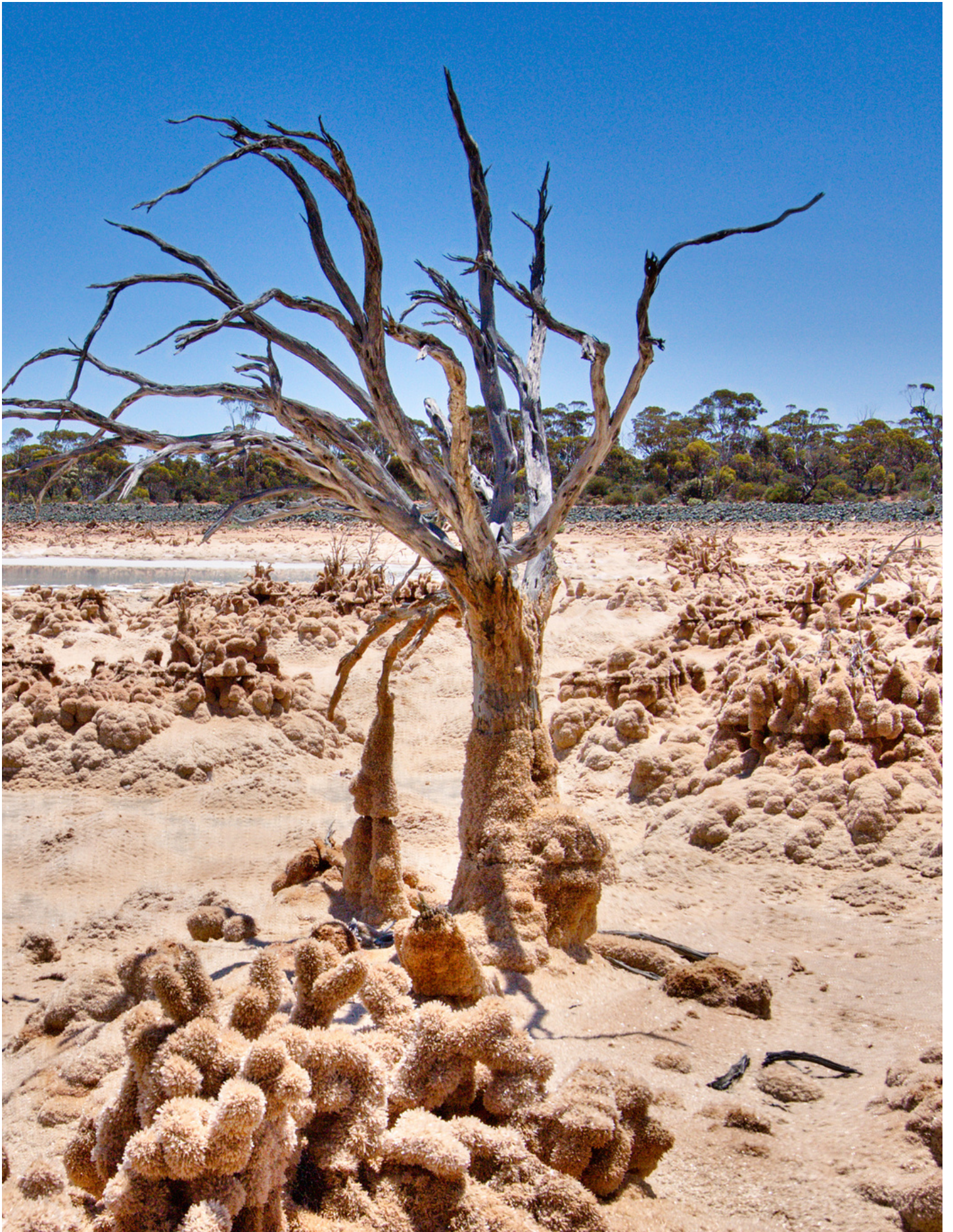
Lake Lefroy, Kambalda