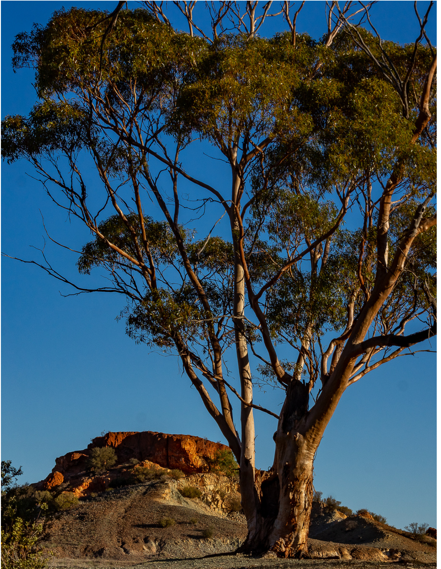
Coolgardie Bluff Cultural and Heritage Trail