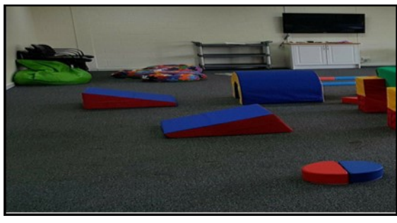
The recreation room ready for Toddler Funtime with an obstacle course prepared.

Heather, our fitness instructor, has been holding these classes for more than six months now. It is great to see the older members of the community coming down and getting involved. By participating they are learning about a healthy lifestyle and