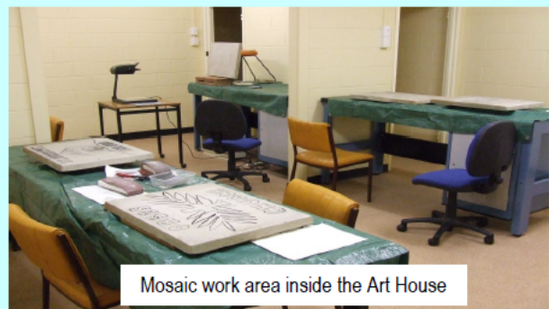
Mosaic work area inside the Art House